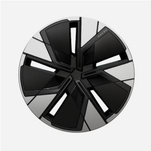
20" 5 Spoke Aero