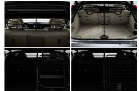
Pet Accessories - protective steel grille, dog gate, load divider and dog load liner

We have an extensive range of protection, convenience, lifestyle and adventure Accessories for your Volvo and you can browse our entire range here: https://volvocarsaccessories.co.uk