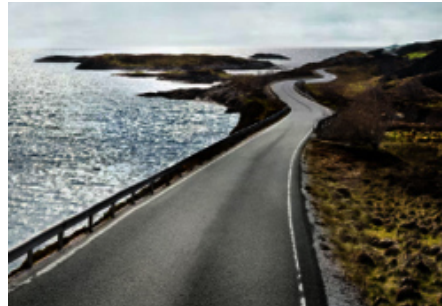
Vodafone Automotive VTS S5 Tracker - with 3 years subscription