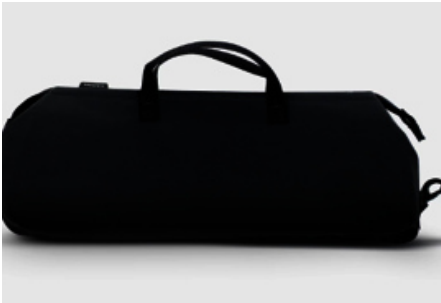
Charging Cable Bag