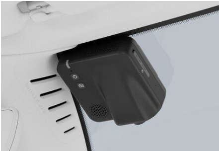
Dash Camera - front and rear