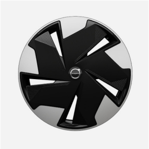
19" 5 Spoke Aero