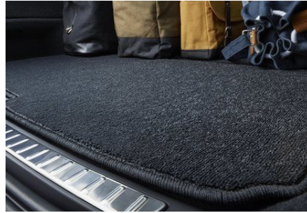
Textile Protection - interior cabin floor mats and load compartment mat