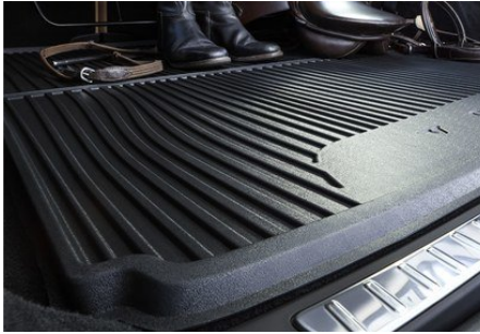
All-weather Protection - interior cabin floor mats and load compartment mat