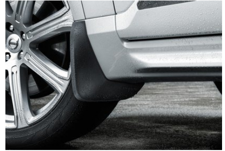
Mudflaps - front and rear