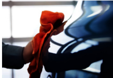
Volvo Car Protect - available for both textile and leather interior, plus exterior paint