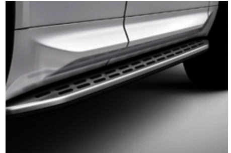
Integrated Running Boards