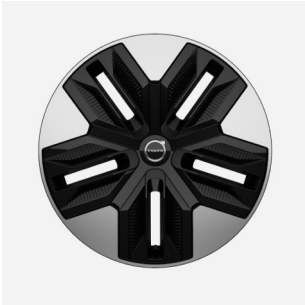
18" 5 Spoke Aero