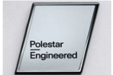
Polestar Performance Optimisation