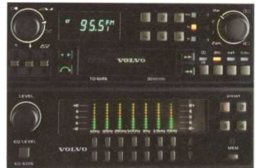
Sensitive and powerful four speaker AM/FM stereo audio system offers cassette receiver with high power amplifiers. System includes clock, 24 station presets, separate bass and treble controls, scan tuning, night illumination. And seven-band graphic equalizer.