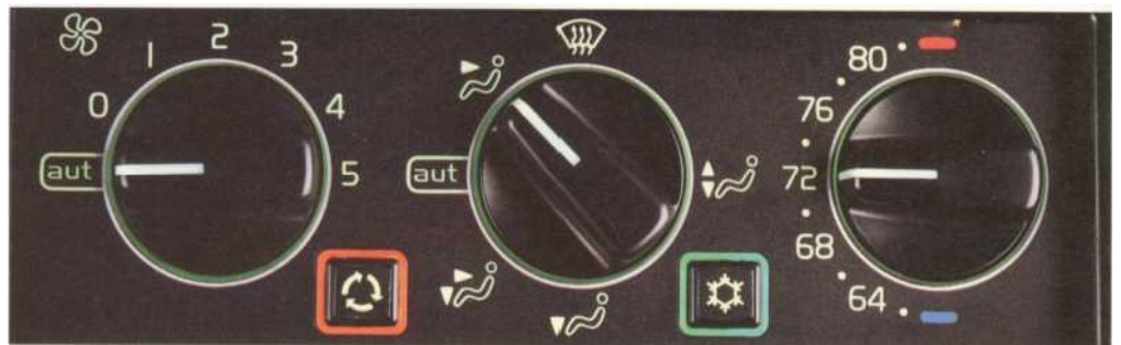
Electronic climate control system is a powerhouse when it comes to modulating air quality and climate -front and rear. Actually employs four separate sensors: to measure sunshine intensity, interior temperature, heat exchanger temperature, and outside air temperature.