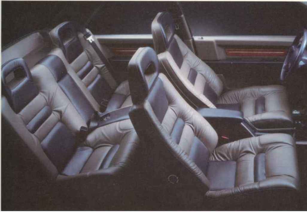
Heated, orthopedically-designed front bucket seats help cradle the body. Offer 8 different adjustments at the touch of a button. Feature manually operated lumbar support, too.